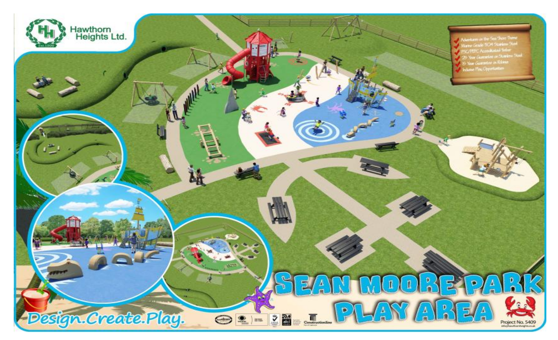
Draft Playground Perspective